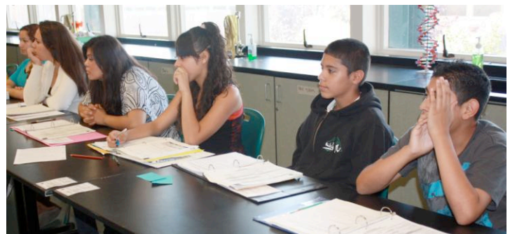
Students participating in Teen Talk

"Teens are not getting this information at home. This is a great way for them to feel comfortable asking the questions they need to ask." - Carmont High School, Special Ed Teacher