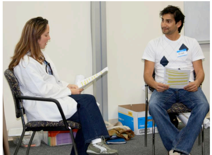
Training participants demonstrating a clinic role-play.

Next Upcoming Teacher Training October 13 th and 14 th in Redwood City Register at www.teentalkca.org